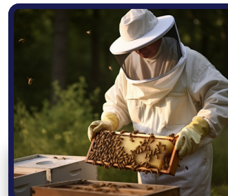
beekeeper in protective clothing