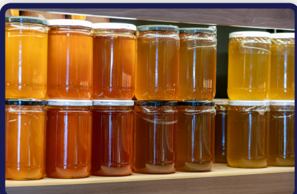
jars of honey

a cake mixture is often made up of eggs, flour, sugar, a fat (such as butter or oil) and milk