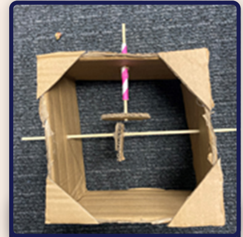
cams mechanism inside a cardboard structure