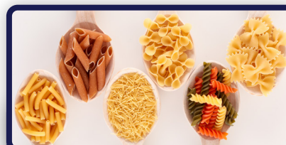
different pasta types