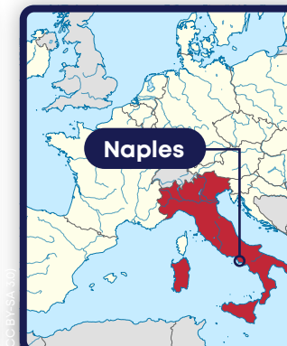
map showing Italy where pasta is very popular