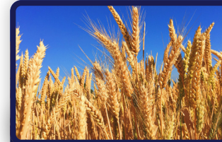
wheat growing in a field

a machine for making butter by shaking milk or cream