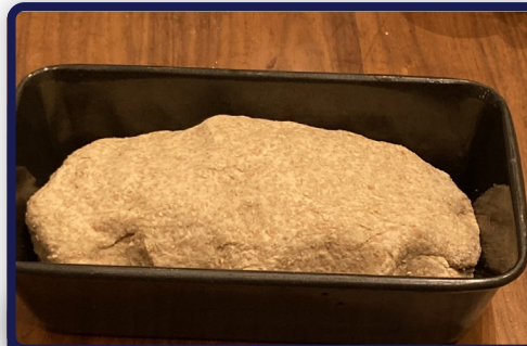
dough in a tin, before it has risen