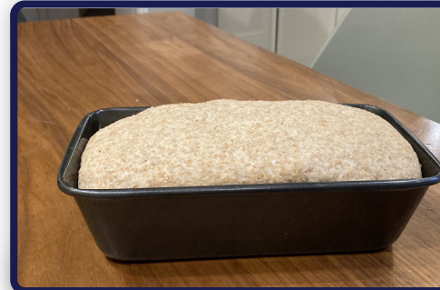
dough which has risen - just before baking