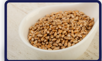
grains of wheat