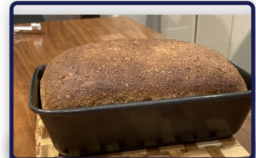
bread which has just been baked in a tin