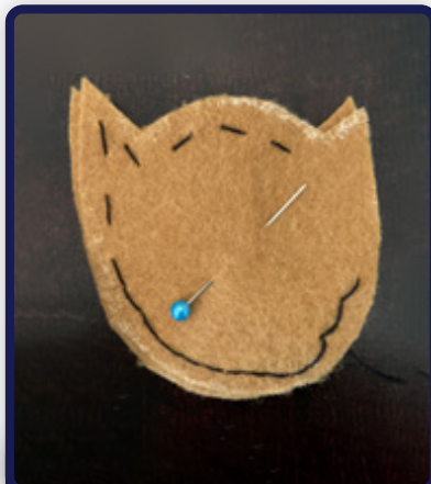
seam made with running stitch and backstitch