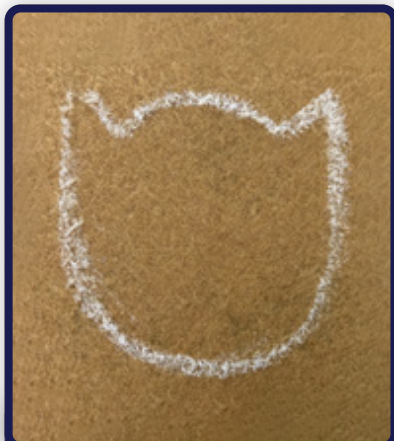
felt showing a shape marked with chalk

these stitches can be used for joining fabric together to create a seam