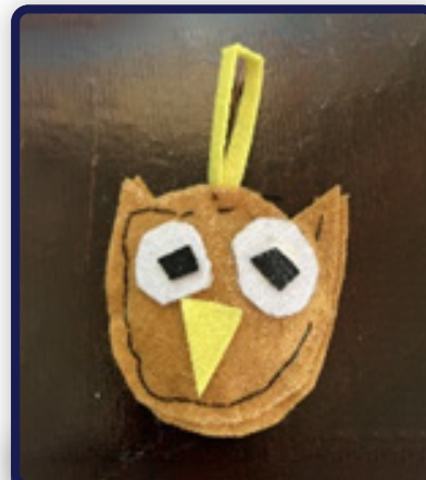
finished decoration/ key ring