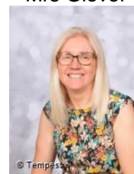
Family Liaison Officer