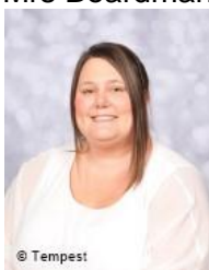
Deputy Head Teacher